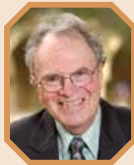
Dr. John Krumboltz