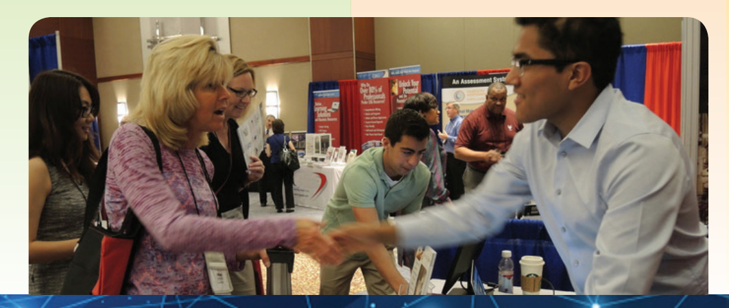
EXHIBIT HALL SCHEDULE

Spots: 6 Minutes: 20 Member: $500 Nonmember: $650